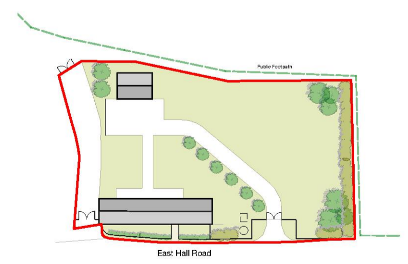
1 Key Plan Scale: 1:1000